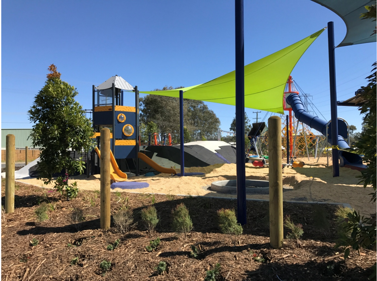
Verona's Park Completed