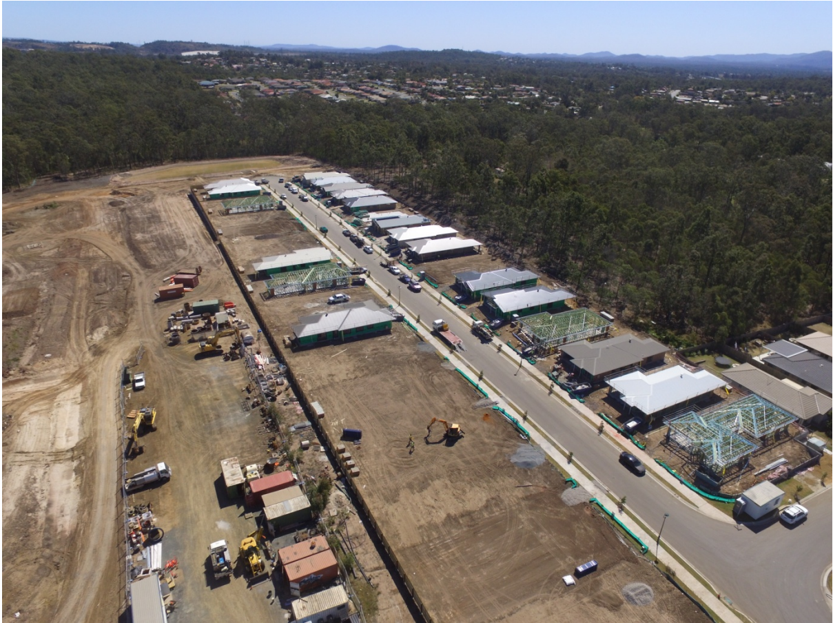
Stage 1: Houses being constructed.