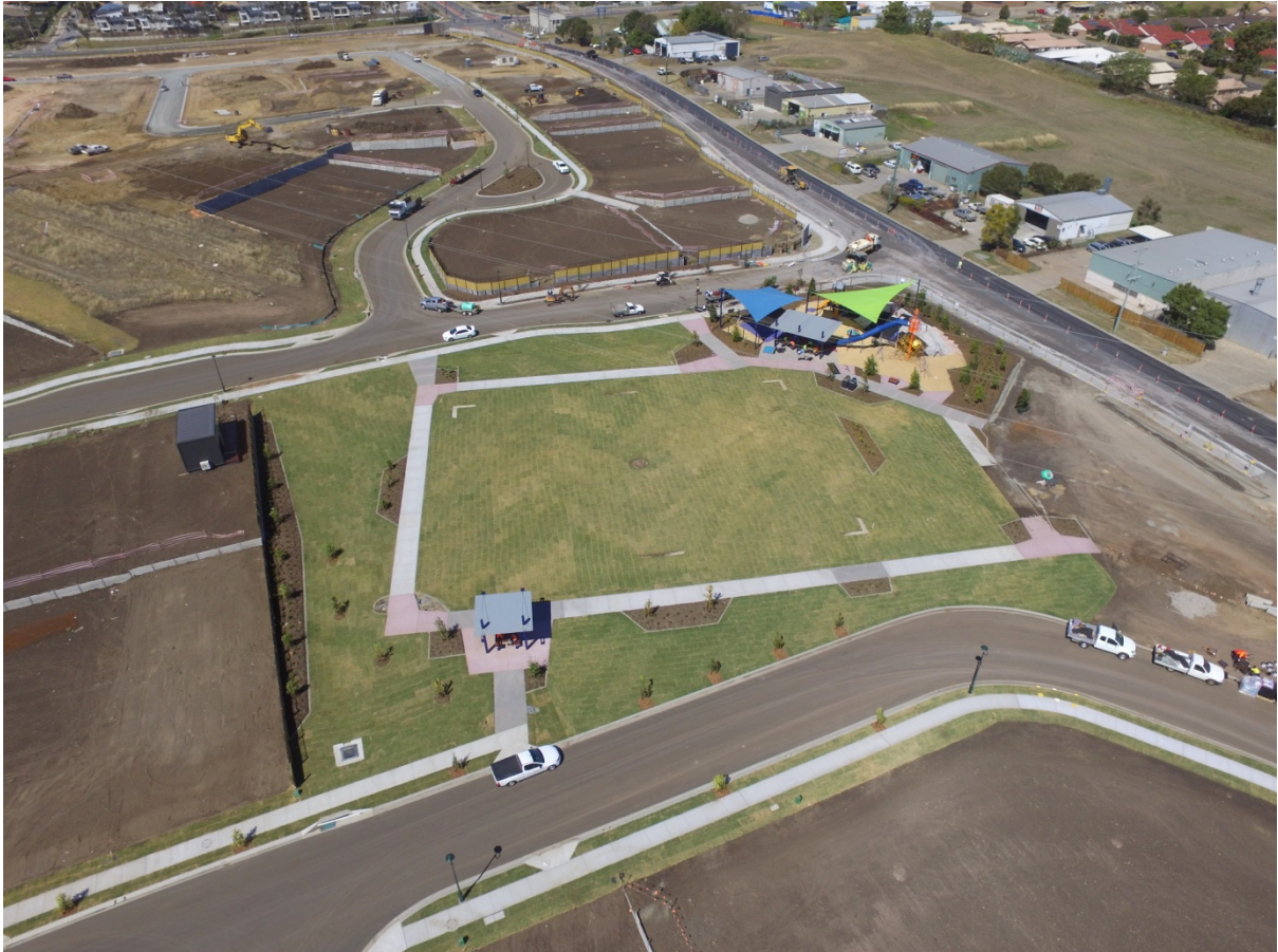
Arial view of completed infrastructure and the park.