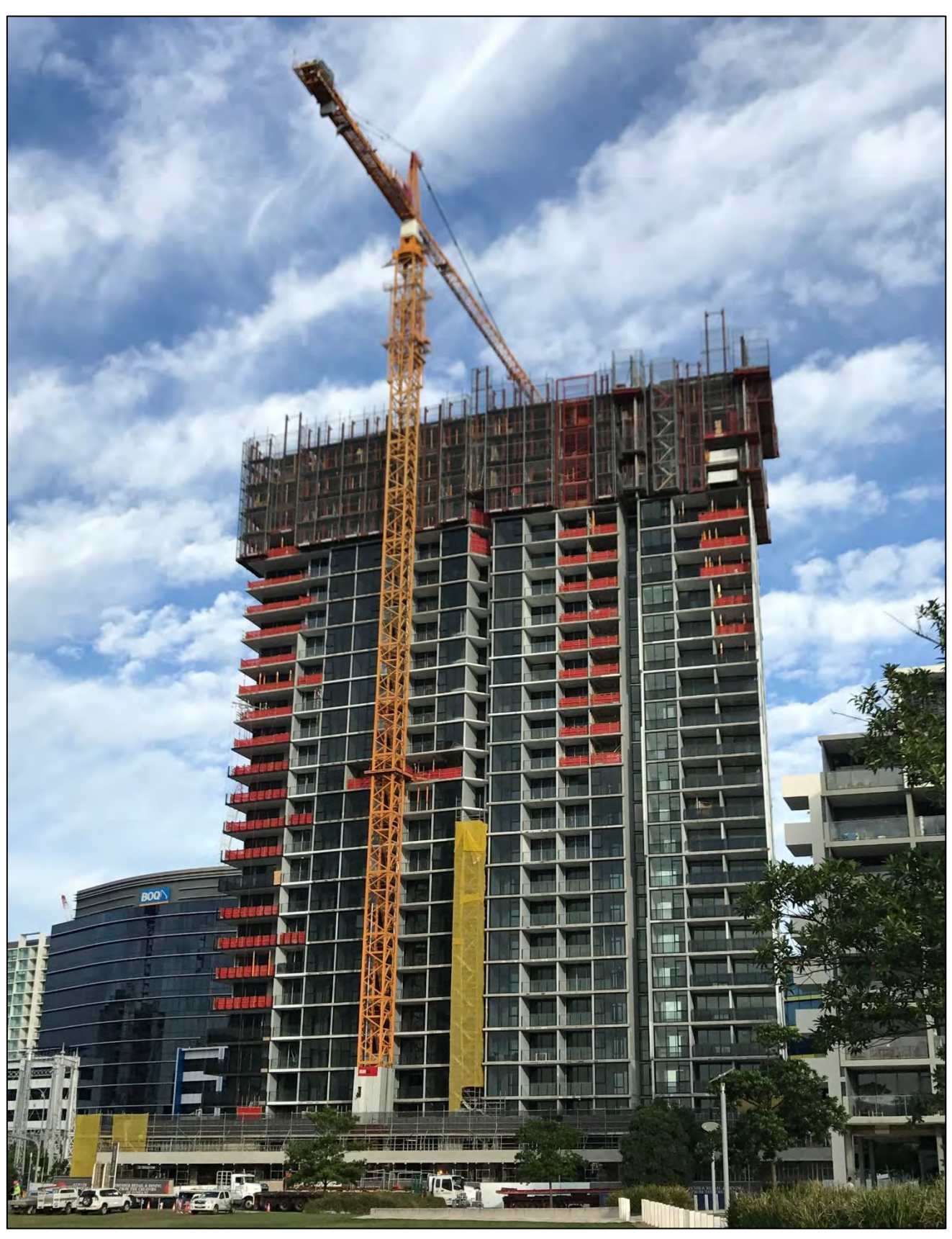
Haven Site: Eastern elevation viewed from Waterfront Park.