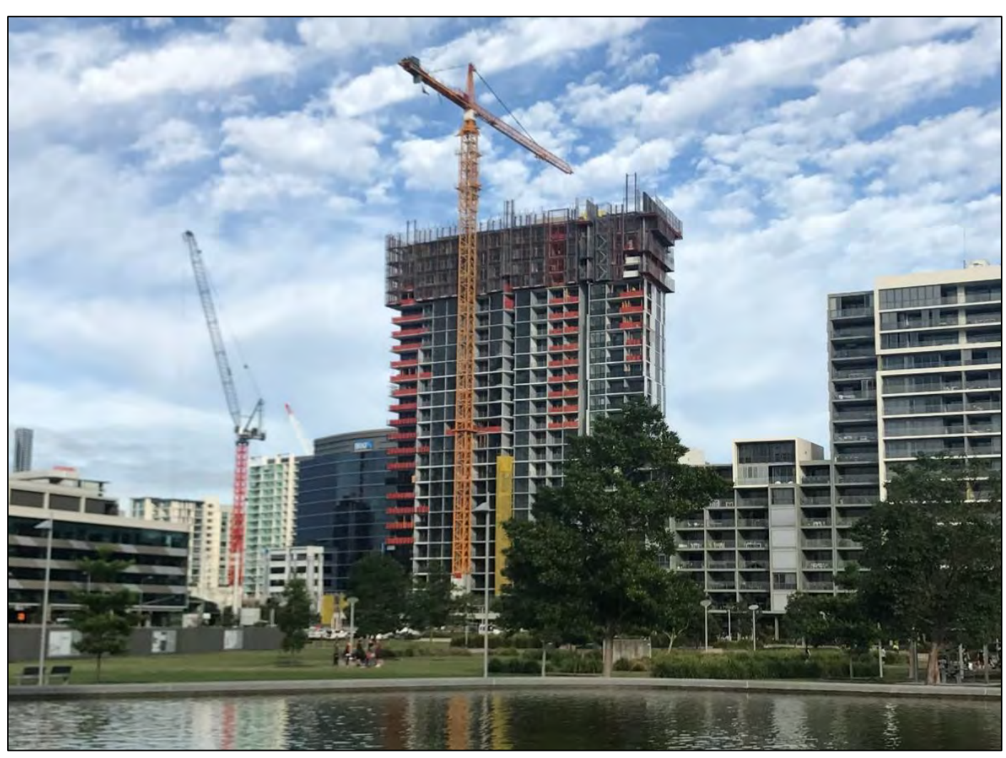
Haven Site: Eastern Elevation viewed from Waterfront Park.