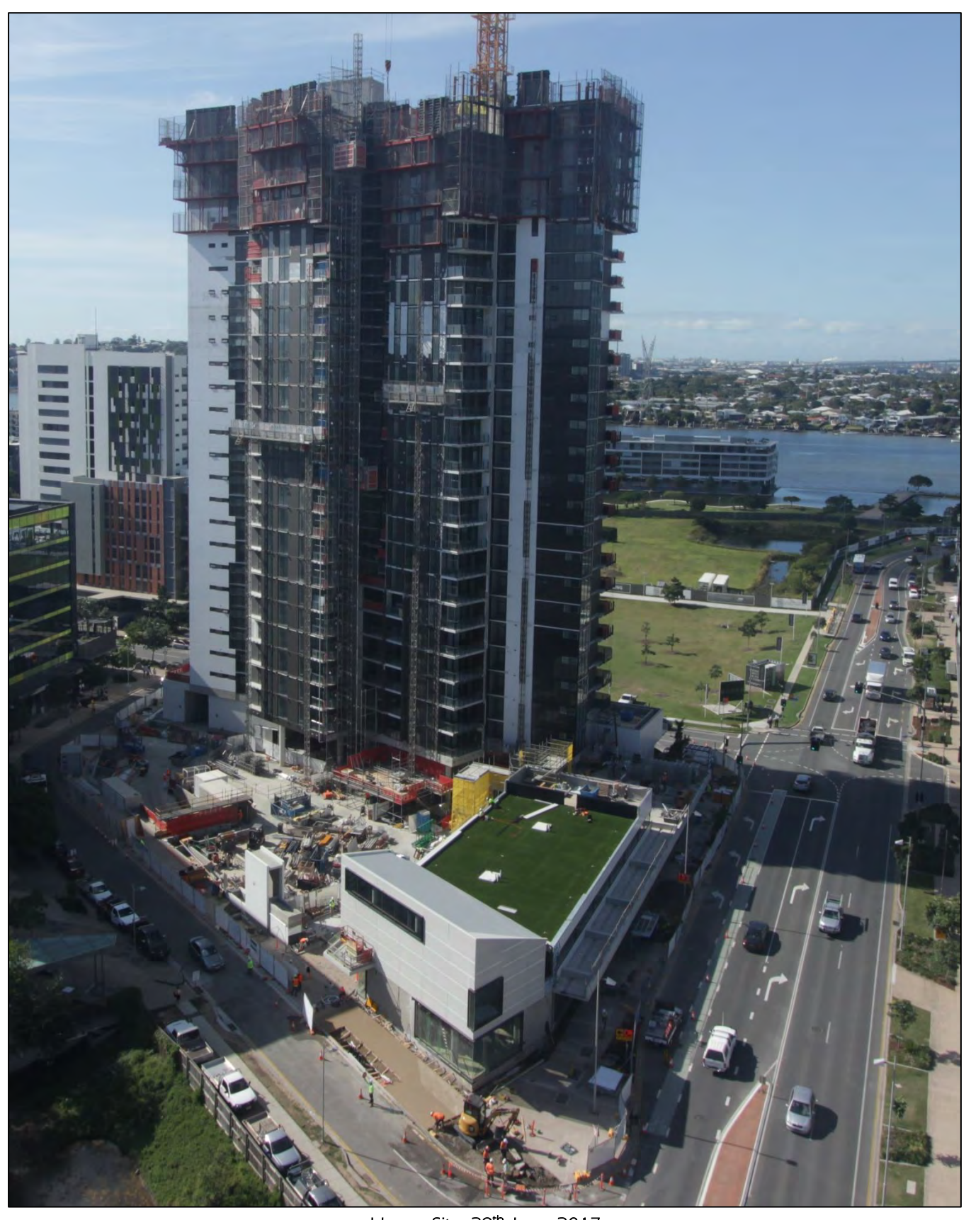
Haven Site: 29<sup>th</sup> June 2017