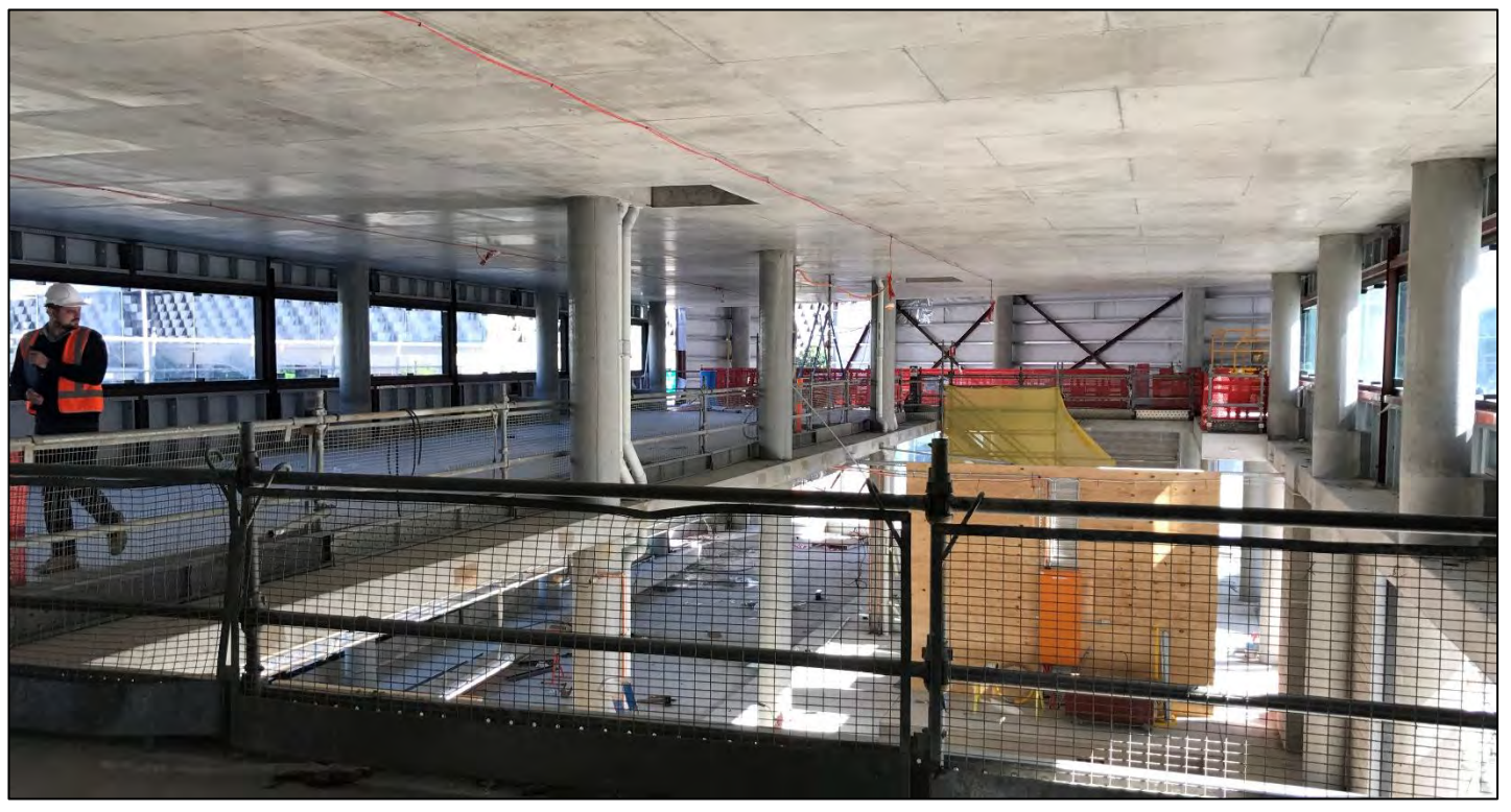
Haven Site: Internal space within the stand alone retail building.