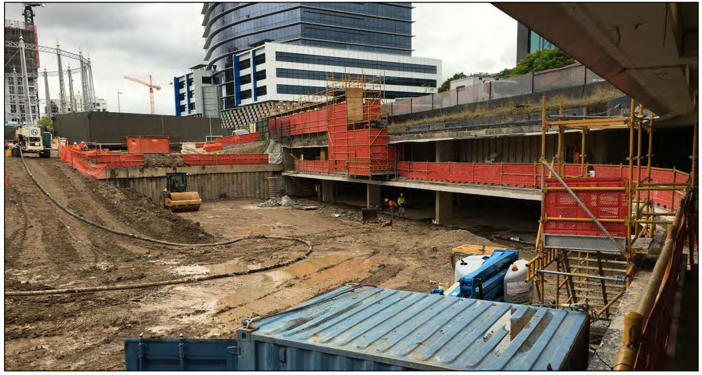
Haven Site: Construction continues in muddy conditions. The basement 2 chamber is now fully accessible. The red fencing screens form part of the worker access ramps to the site offices.