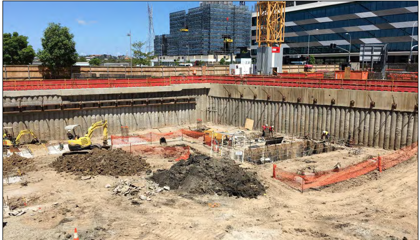
Haven Site: The hole is retained for the base of the lift well which will continue, non-stop to the 25<sup>th</sup> level roof terrace.