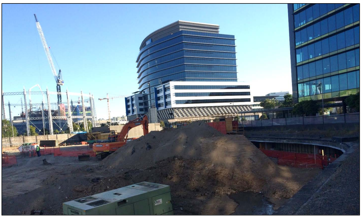
Haven Site: Pile of imported fill used to establish platforms for piling rigs. The material is now in the process of being removed from site.