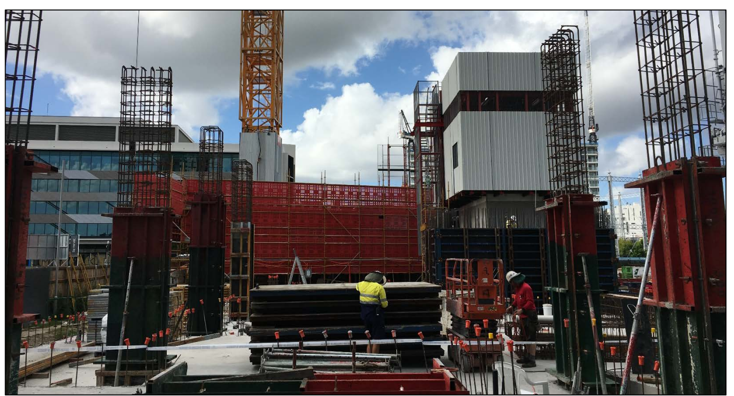
Haven Site: Formwork for columns to support the Level 1 floor slab. The white lift core jump-form is visisble in the top right of the image.