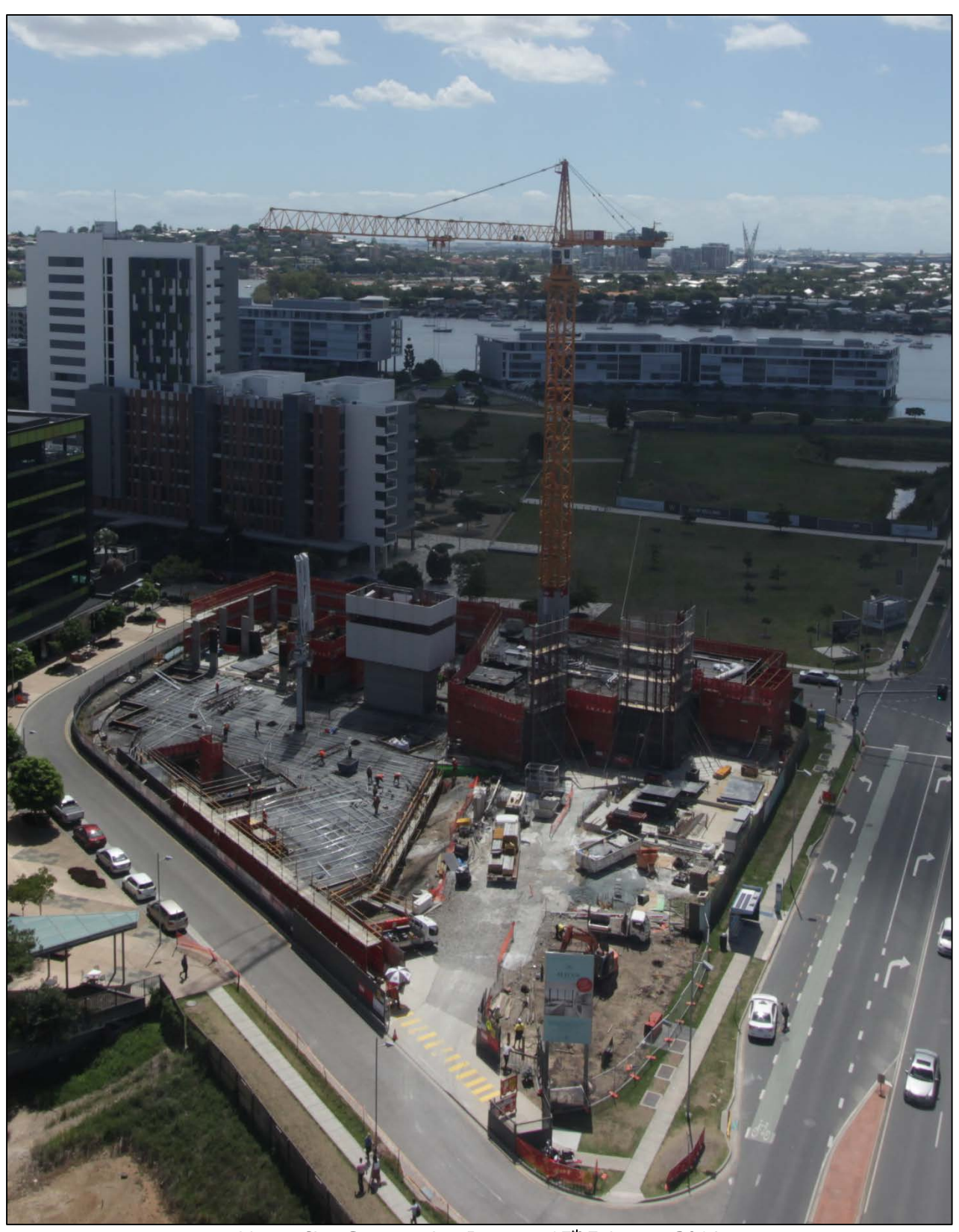
Haven Site: Construction Progress 15th February 2016