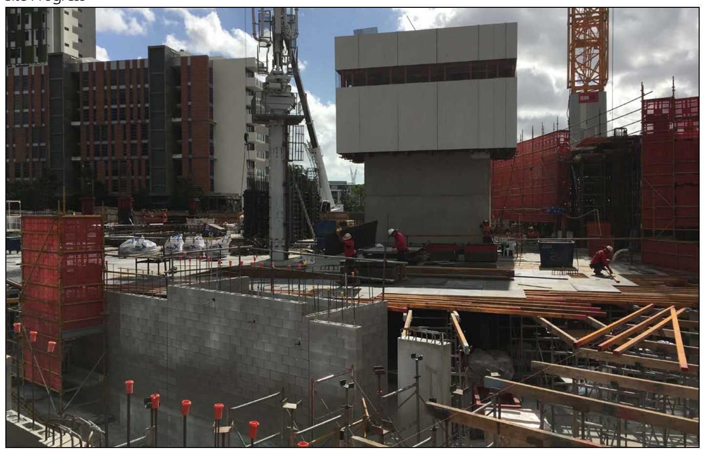
Haven Site: Haven ground level showing the car par ramp (bottom left), form-work for remaining ground floor slab (bottom right), lift core and jump-form (center), and tower scaffolding (top right).