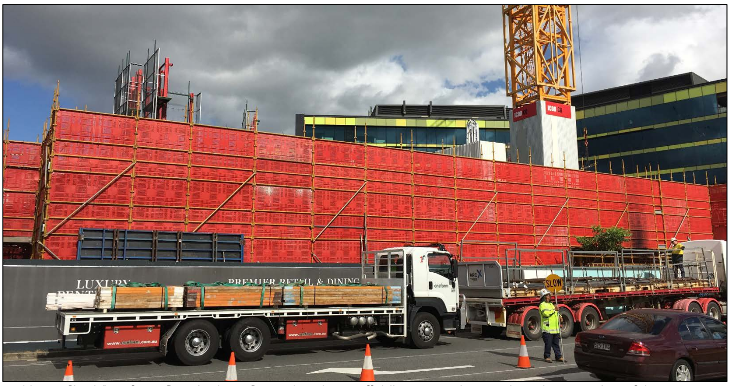
Haven Site: View from Cunningham Street showing scaffolding erected around southern portion of the tower.