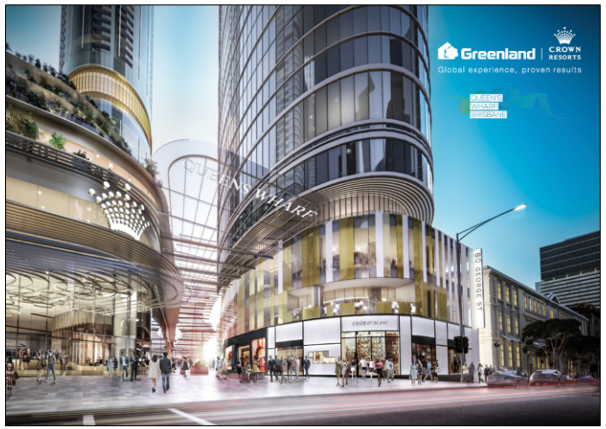
Greenland Crown Consortium's proposal for high retail in the new Queens Wharf