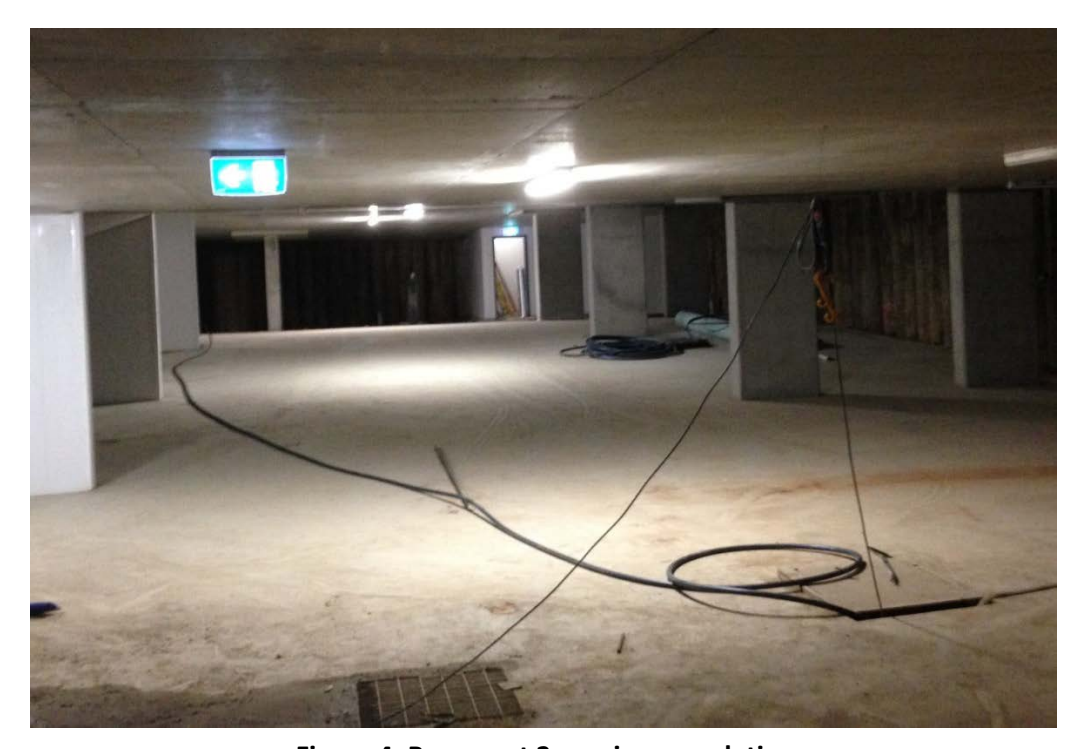
Figure 4: Basement 2 nearing completion.