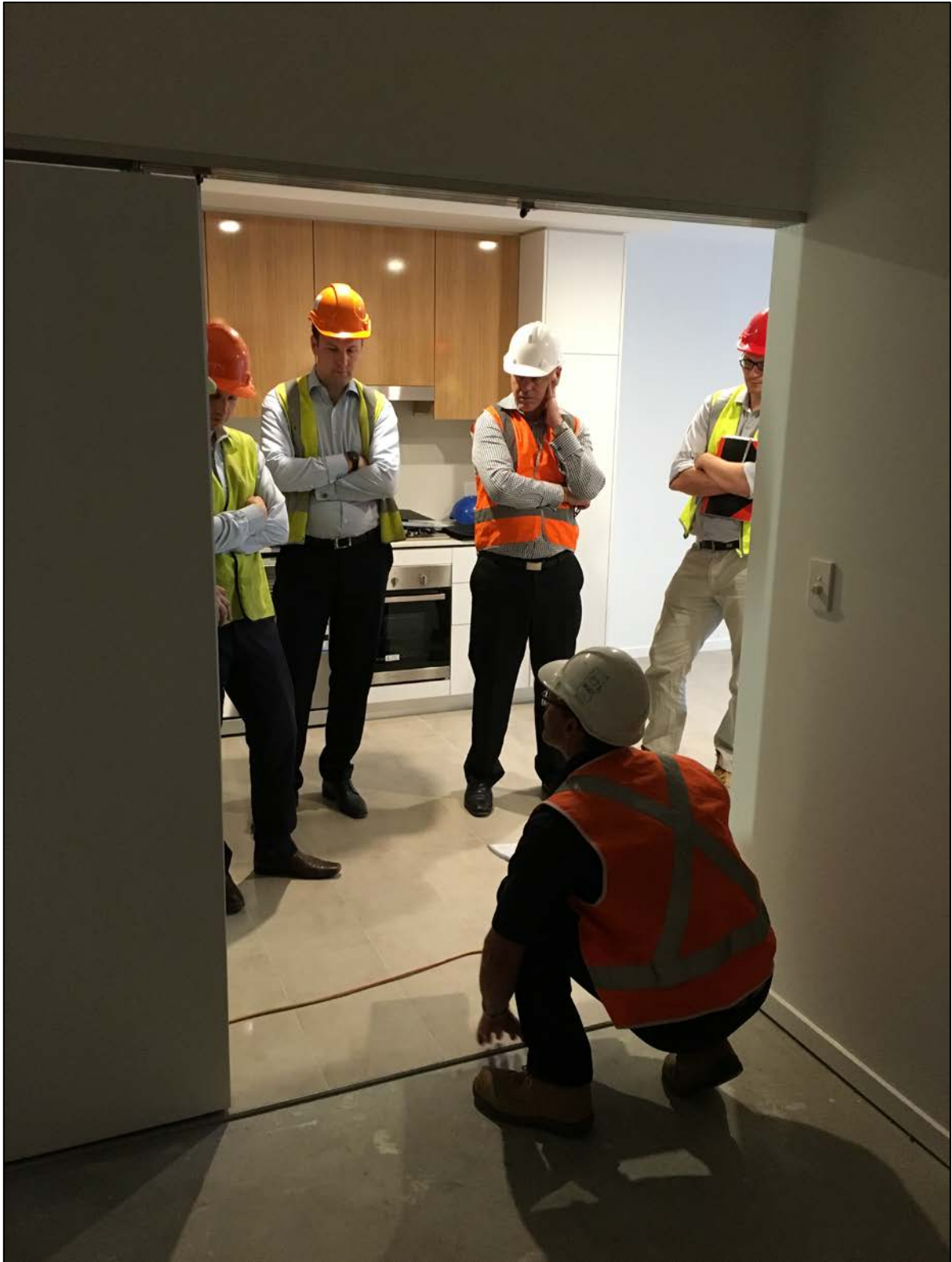
Figure 7: The site manager explains the proposed system to improve the sliding doors to MPR.