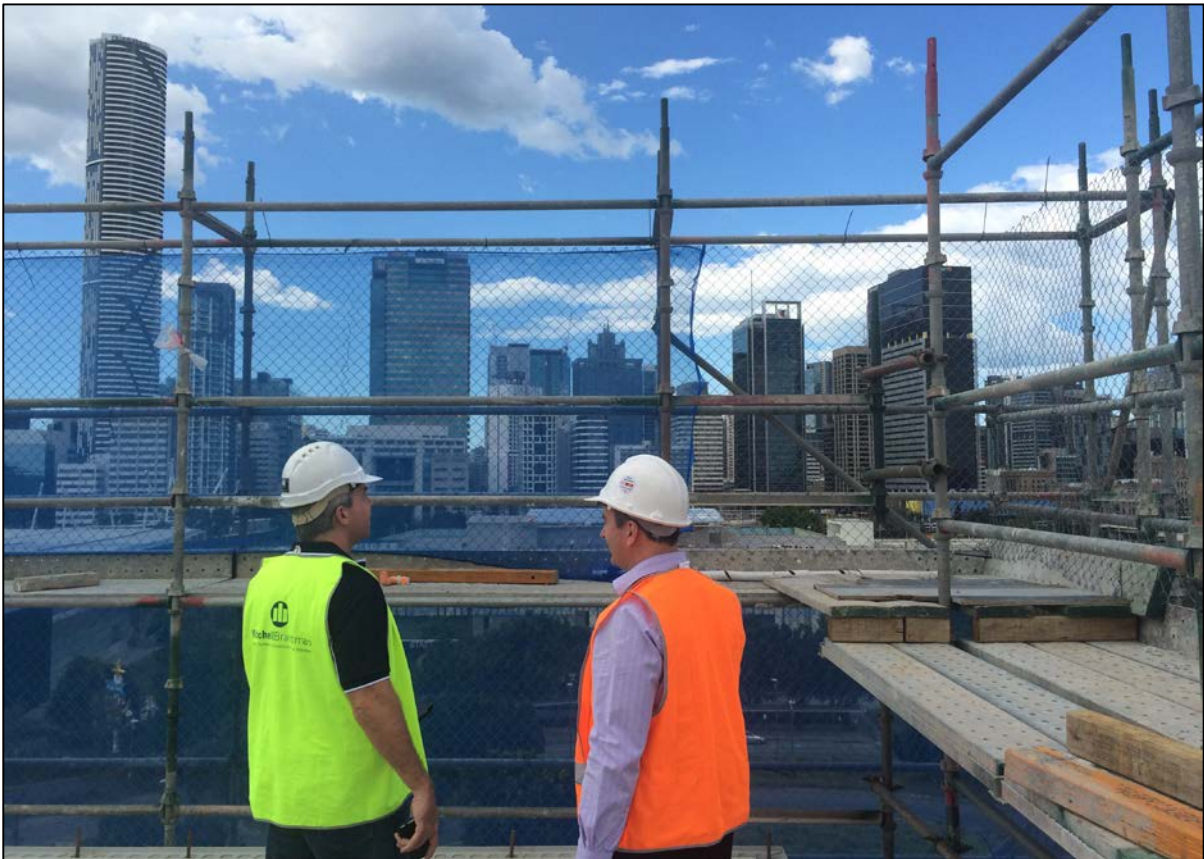
Figure 1: Fleet Lane rooftop slab now complete with superb views of the Brisbane CBD.