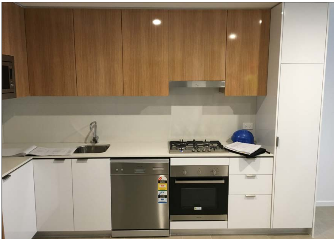
Figure 6: Inspection of the prototype kitchen. The team has raised an error in the ranghood which should be flush with the neighbouring cupboards.