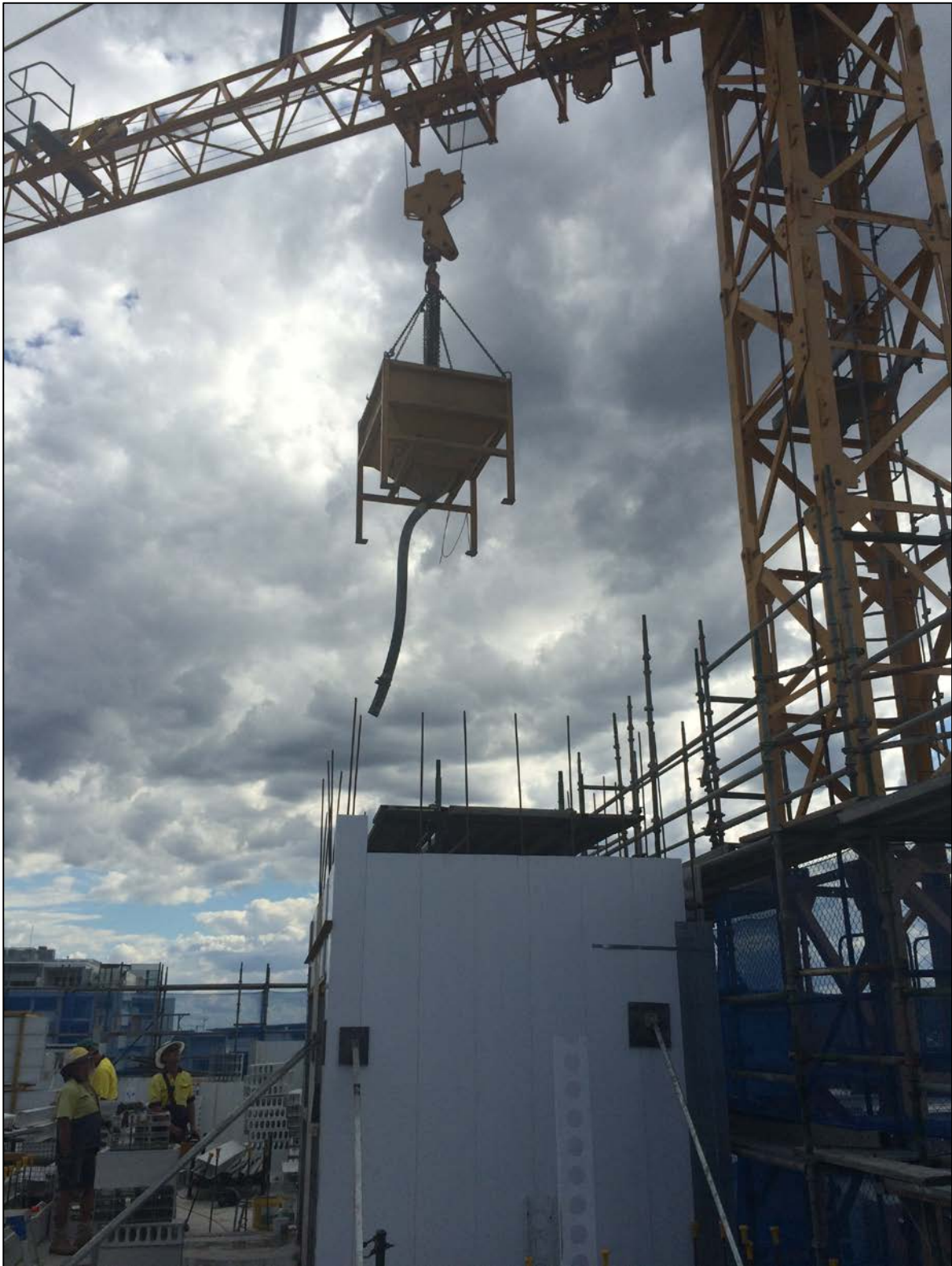
Figure 3: The tower crane pouring concrete to form the top of the lift well.