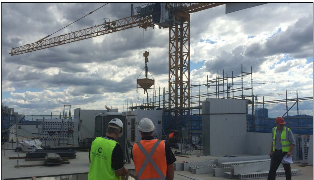
Figure 2: Fleet Lane Rooftop – Inspection of the roof top by the super intendent and quantity surveyor.