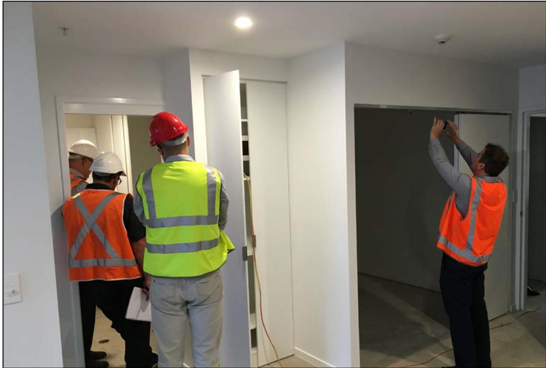
Figure 4: Inspection of the prototype unit by the development team.