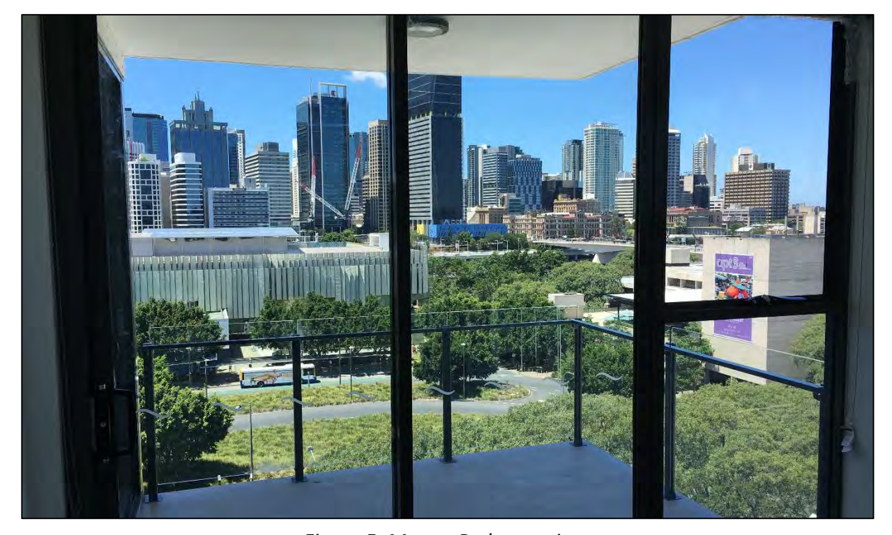
Figure 5: Master Bedroom views.