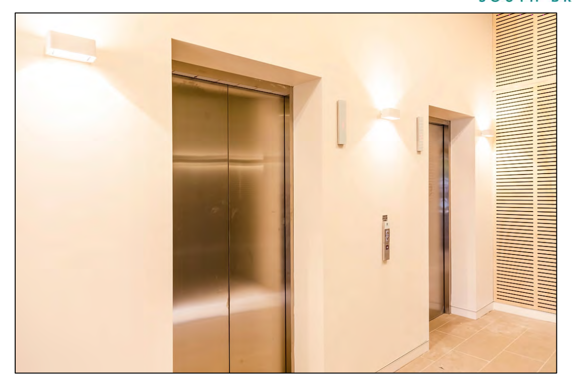
Figure 2: Fleet Lane Lift Lobby.