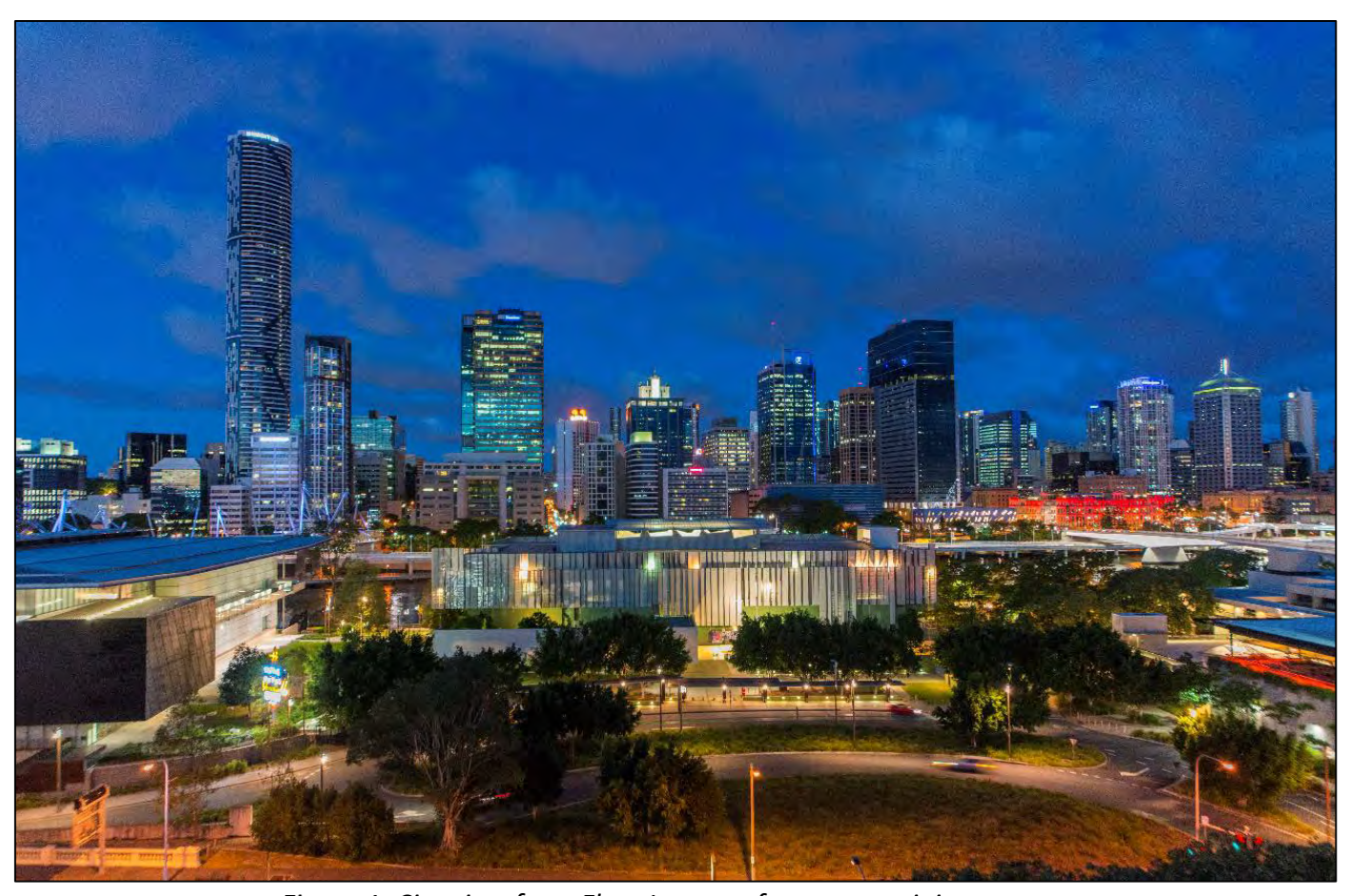
Figure 1: City view from Fleet Lane roof top entertaining area.