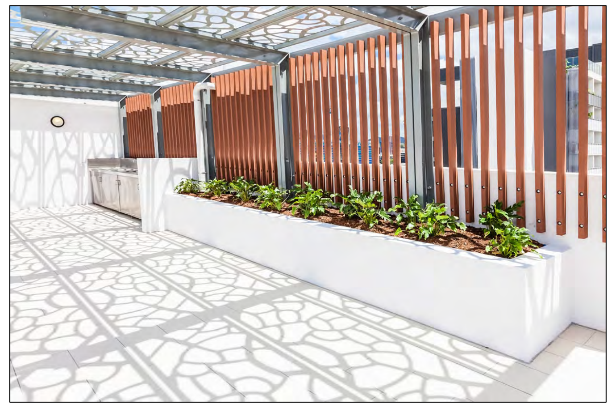
Figure 4: Fleet Lane roof top BBQ and Dining area. A high-end furniture package has been purchased and will be deliverd prior to settlments.