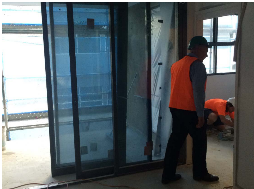
Figure 5: Level 3 – Inspection of master bedroom.