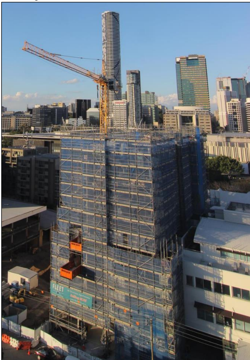
Figure 1: Fleet Lane overview.