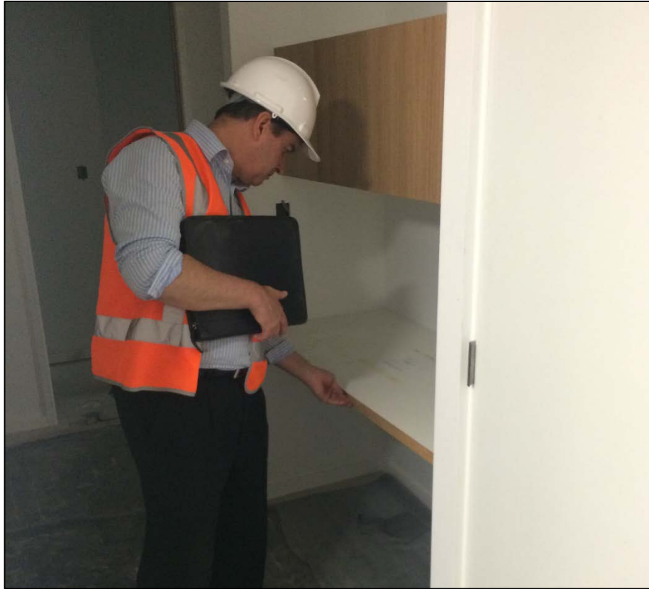
Figure 6: Inspection of study desks for quality assurance.