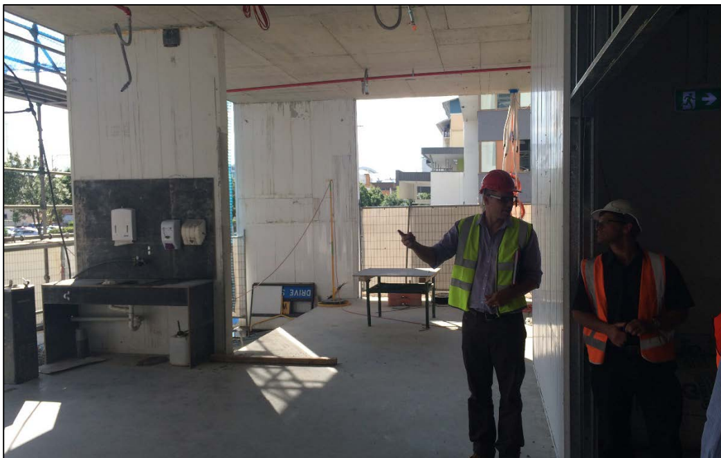
Figure 3: Hope Street entrance (main entrance).