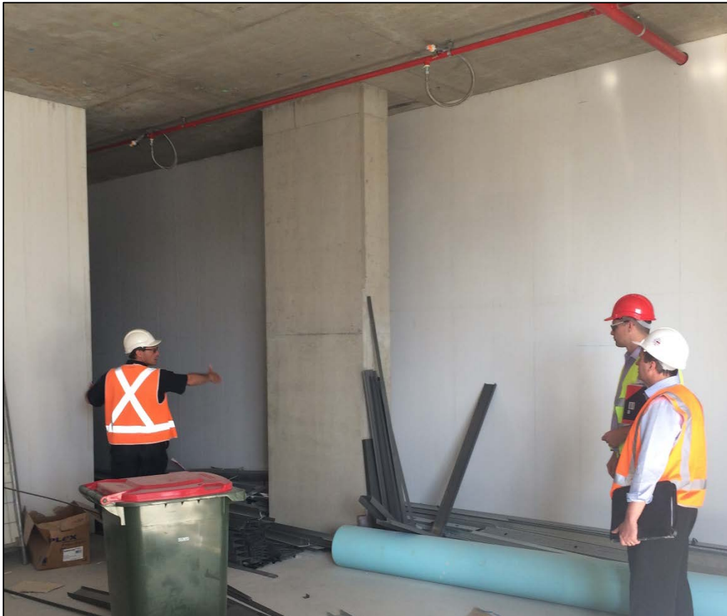
Figure 2: Fleet Lane lobby – Inspection of lobby access by the construction manager, superintendent and development manager.