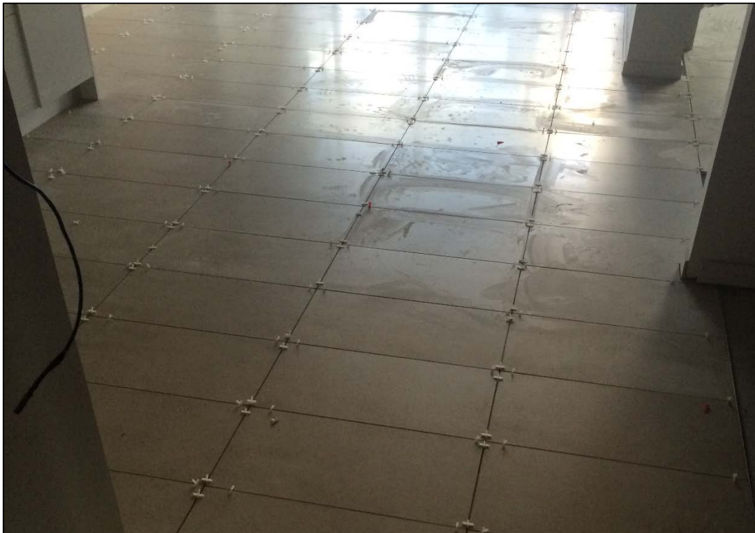
Figure 7: Tiling recently laid. Once dry, the grout is applied to fill gaps.