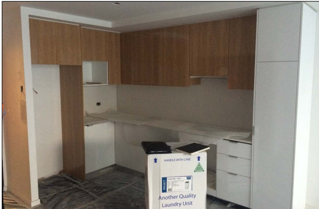
Figure 4: The construction team have selected a 1 bedroom apartment as the prototype apartment. The kitchen spaces are measured on-site by the joiner and then manufactured off-site. The units are then transported to the building to be assembled in each apartment.