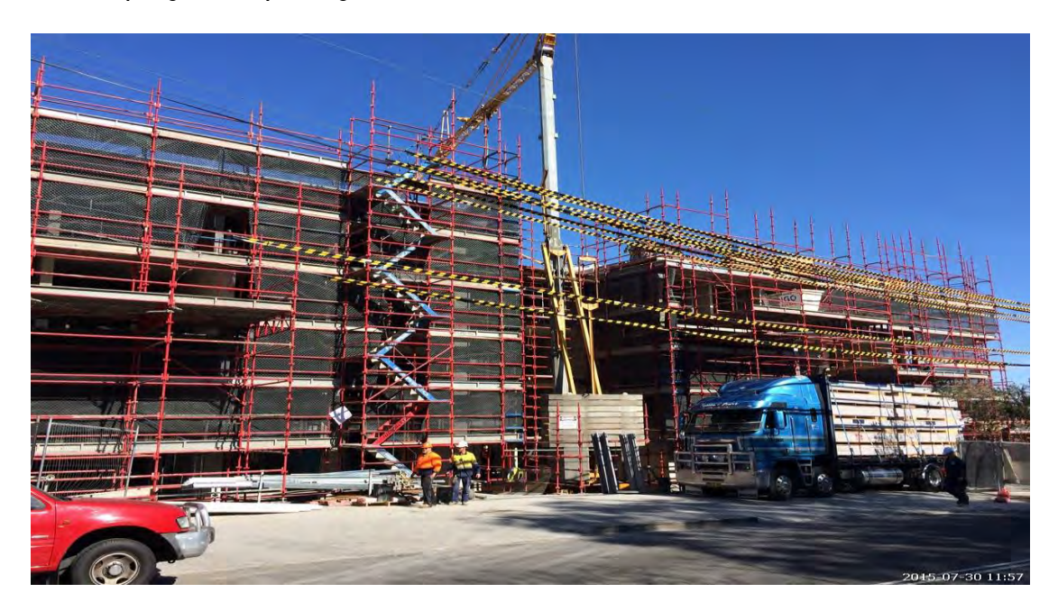
Photo 1: Shows the installation of perimeter scaffold and safety mesh which is erected up to level 4 or the same height as the roof deck. The Self-Erecting crane is located in between the East and West decks and continues to assist greatly with materials handling and logistics. A large delivery of sheeting (gyprock panels) has arrived which is progressively being installed into the Ground Floor units.

<u>Photo 2:</u> Shows the completed roof deck; all structural works are now completed which is an important milestone for the project. The lift over-run is located in the middle of the photo with a number of skylights servicing the Level 3 units. This is the view looking west towards the Parramatta region. When facing south you can see the City CBD.