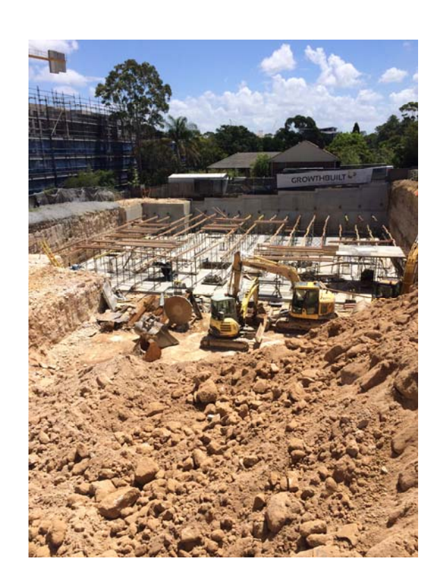
Photo 1: The Basement One western side's suspended slabs frames and bearers formwork being erected and installed at the beginning of February: