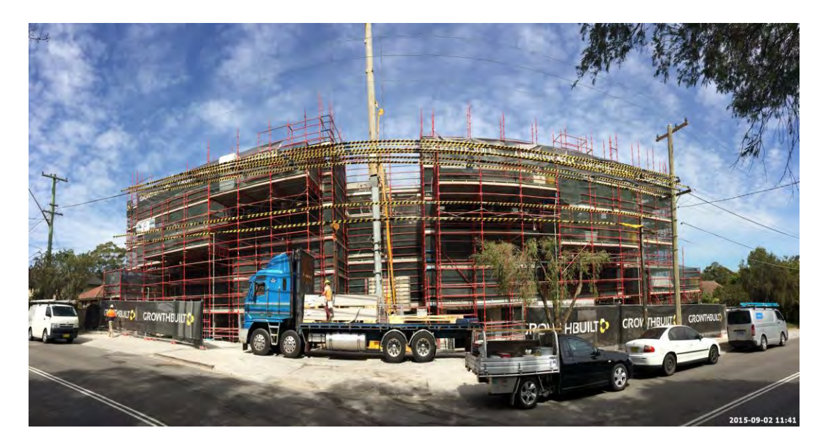
Photo 2: Shows sections of the external render applied on Level 3 external walls.

<u>Photo 1:</u> Shows the installation of perimeter scaffold and safety mesh erected up to level 4 or the same height as the roof deck. It is not visible in this photo but the external render has commenced on level 3. The scaffold is scheduled to be removed by mid-October 2015 which will reveal the external façade.