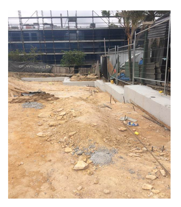
Photo 2: The sewer diversion works to the rear of the property have been excavated and the pipes have now been laid. The sewer inspection and final connection is being carried out this Friday.

Photo 1: The capping beam to the western and south west corner has been poured and stripped. This capping beam has been poured of the 18 piers which were shown in the previous report