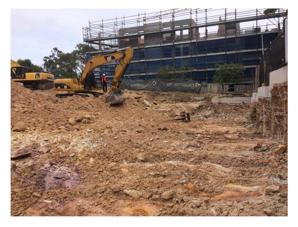
Photo 4: This photo was taken on the 19<sup>th</sup> November and shows that the first level basement has almost been excavated and removed. The bulk earthworks are approximately 40% complete. The first row of anchors has been drilled and needs to be grouted.

Photo 3: This photo shows that the earthworks have commenced. The material which is currently being removed is medium sandstone with a small amount of clay.