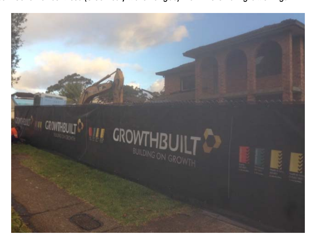
Photo 2: Demolition has commenced. This photo shows that No.602 has been removed entirely and No.600 has been partially demolished

Photo 1: Site Establishment has been completed by the builder. This includes the erection of the temporary construction fence, shade cloth, sediment control and the disconnection of services (electrical, water & gas) from the existing dwellings