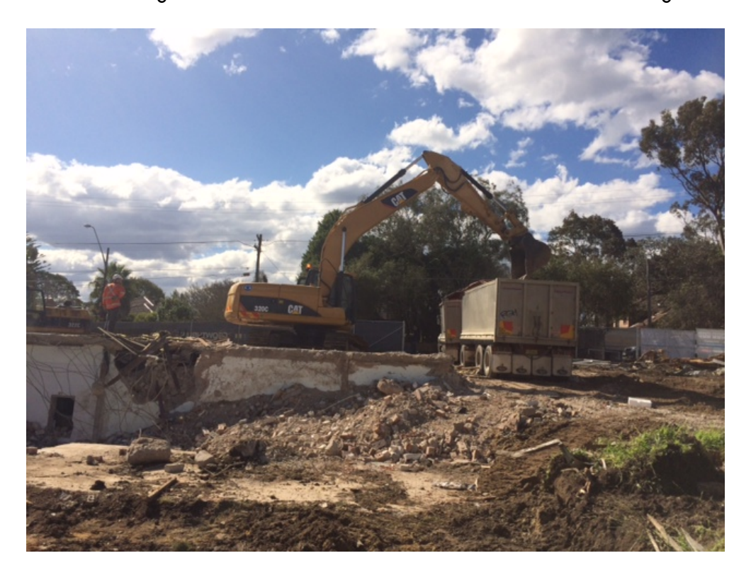
Photo 4: Demolition to No.606 has commenced as seen below. In this photo you can see the second excavator demolishing this building while the other is loading out the demolition material