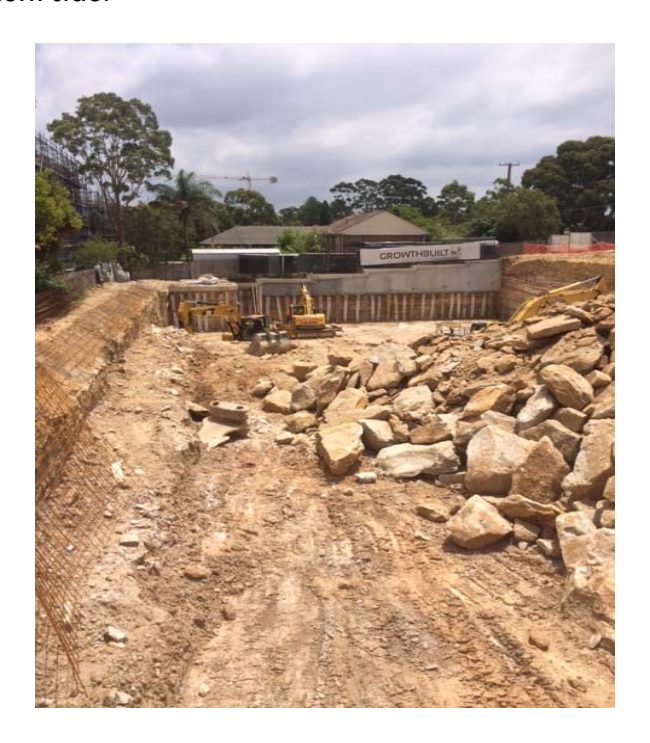
Photo 4: The bulk earthworks to the second basement on the western side has reach the maximum bulk excavation level. The plumber and detailed excavation can now commence

Photo 3: This photo was taken on the 10/12/14. As you can see the concrete to the first drop of shotecrete has been completed on the western side. The reinforcement and drainage cell has also been completed for the second drop awaiting the concrete to be applied. The reinforcement has also been installed over the sewer diversion works on the southern side.