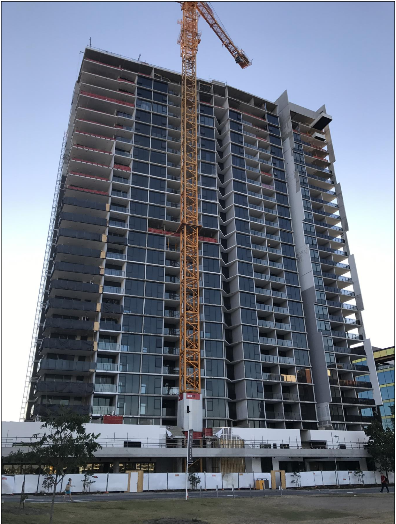
Haven Site: Eastern elevation viewed from Waterfront Park.