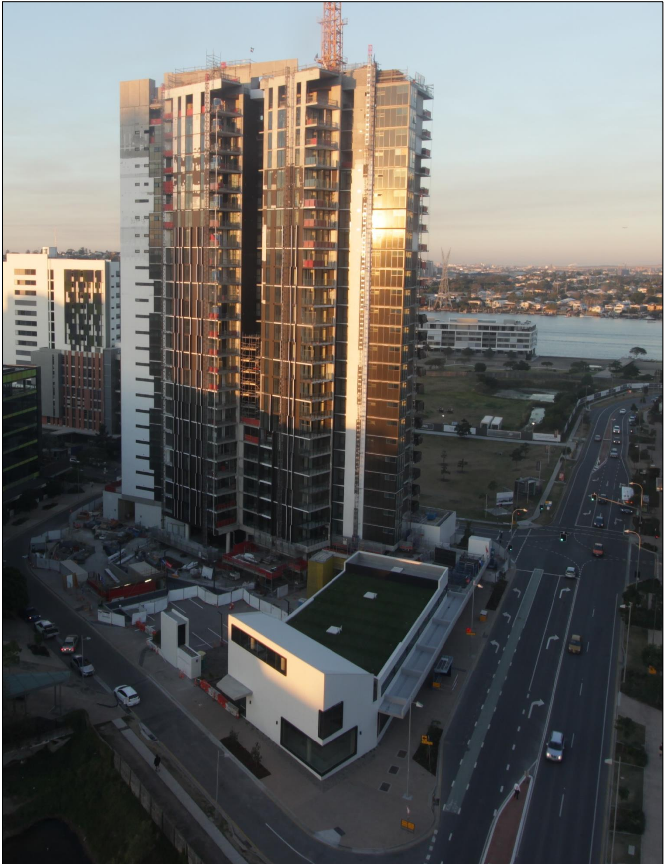
Haven Site: 15 th August 2017