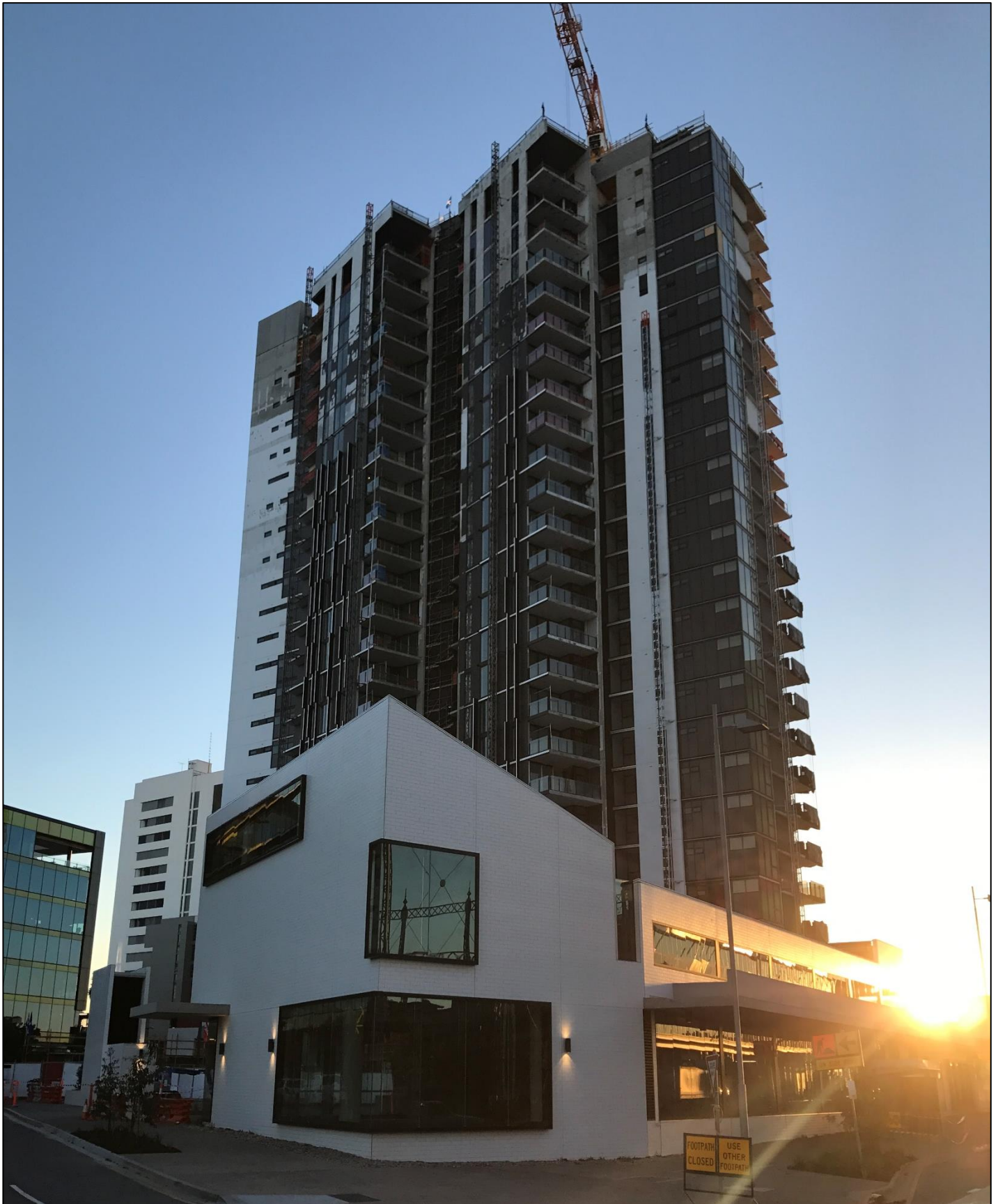
Haven Site: Western elevation viewed from Gasworks Plaza.