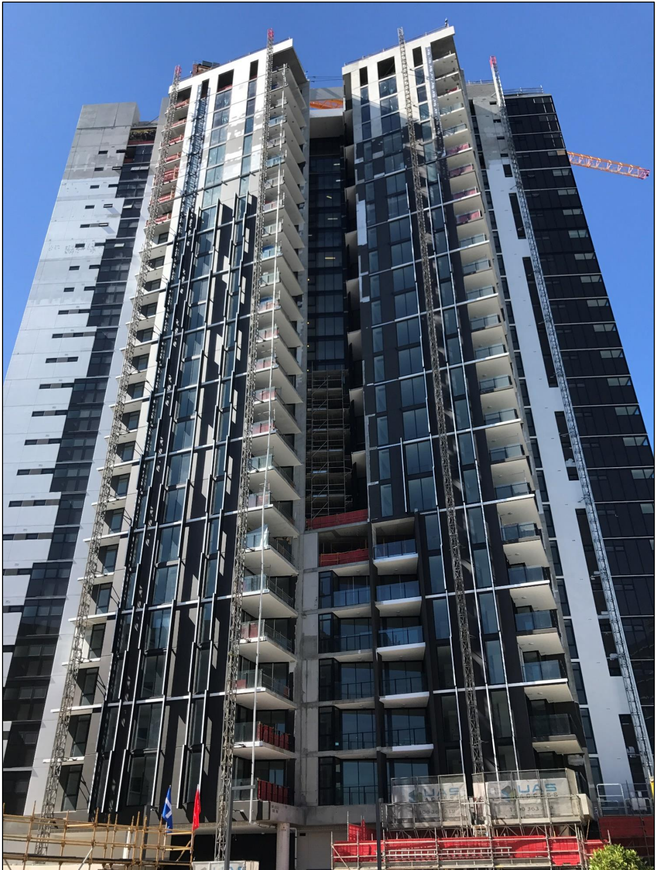
Haven Site: Western façade with remaining scaffolding being dismantled.