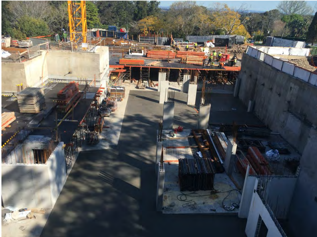
Photo 1 – The photo below from the 5 th of September shows building B's freshly poured slab on ground. Building C in the background has formwork and reinforcement in place preparing for level 1 slab pour.