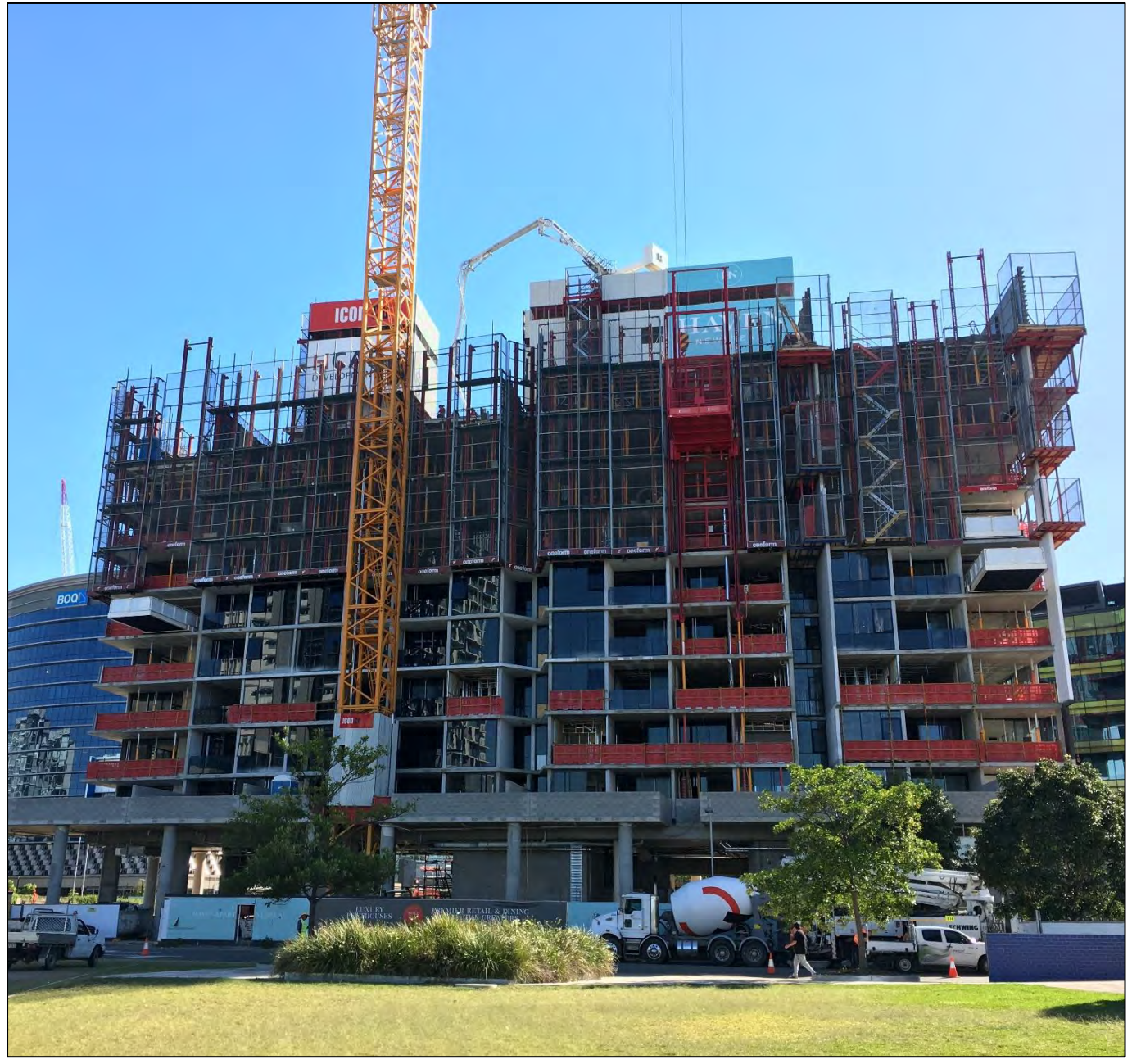
Haven Site: Eastern Elevation from Waterfront Park – Concrete is pumped from trucks on Cunningham Street, through the building to the top Level to form structural walls.