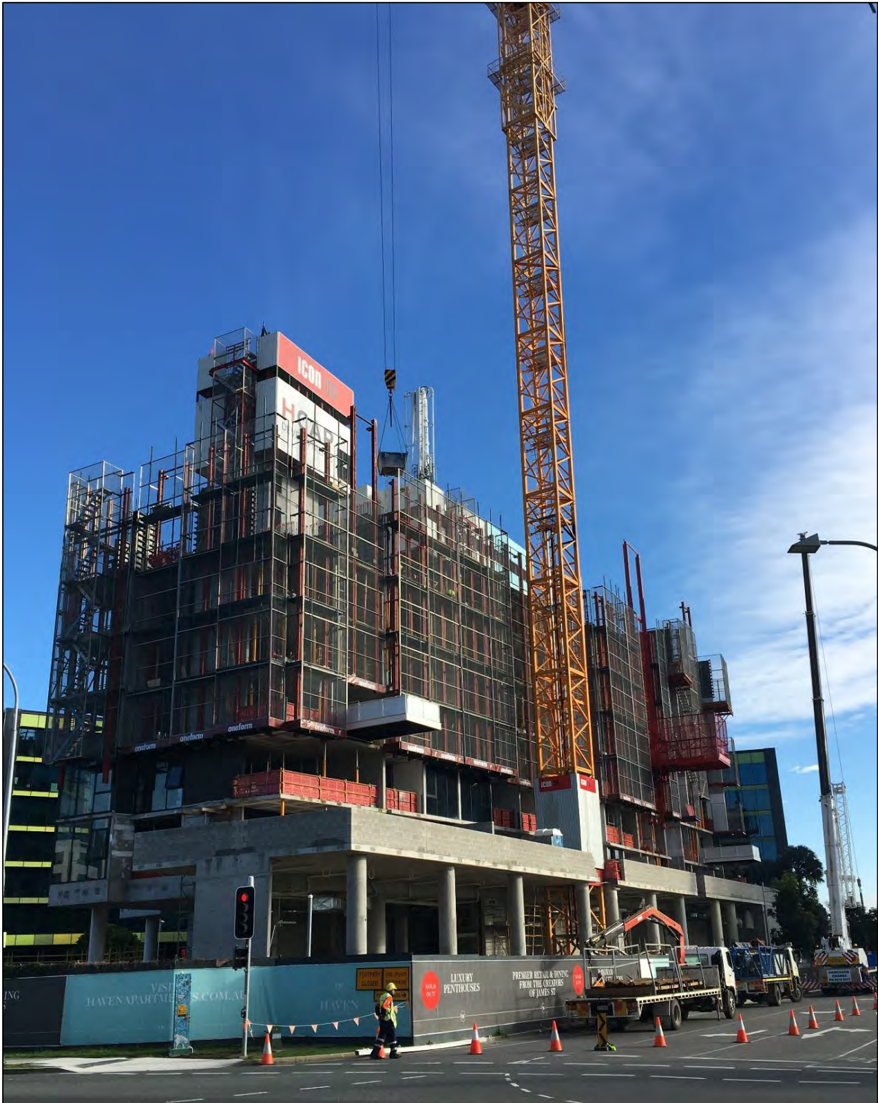
Haven Site: Retail tenancies fronting the corner of Cunningham Street and Skyring Terrace.