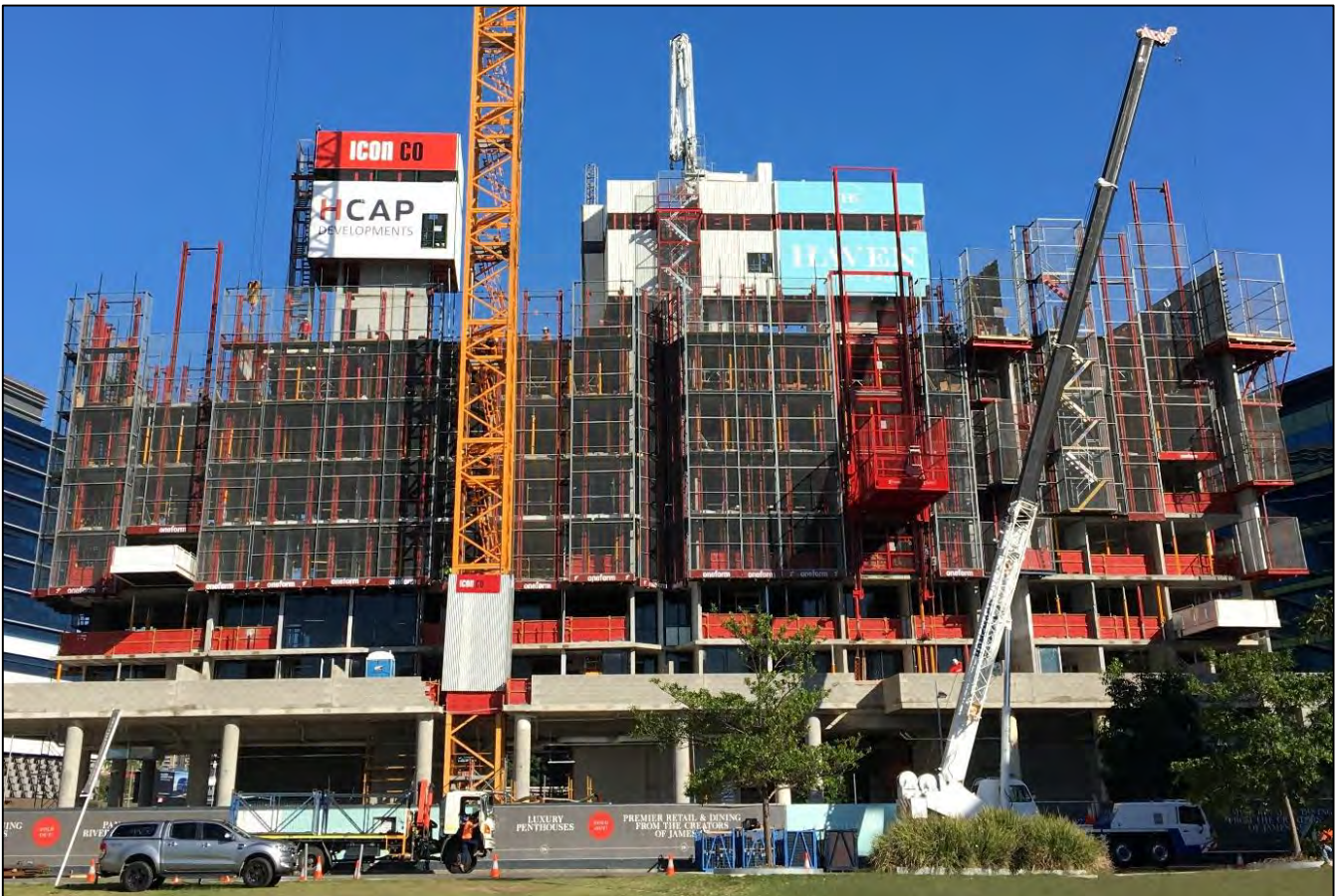
Haven Site: View from Waterfront Park at the eastern elevation.