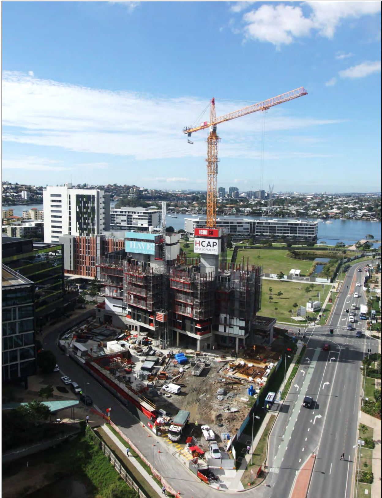
Haven Site: 20 th July 2016