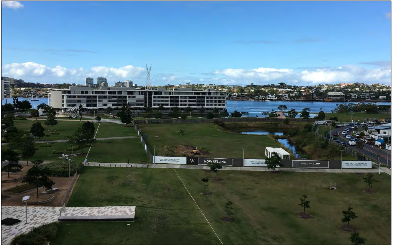
Haven Site: Easterly view to Waterfront Park from Level 6.