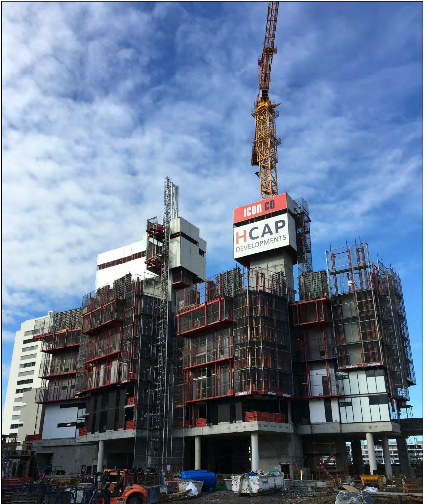
Haven Site: Western Elevation.