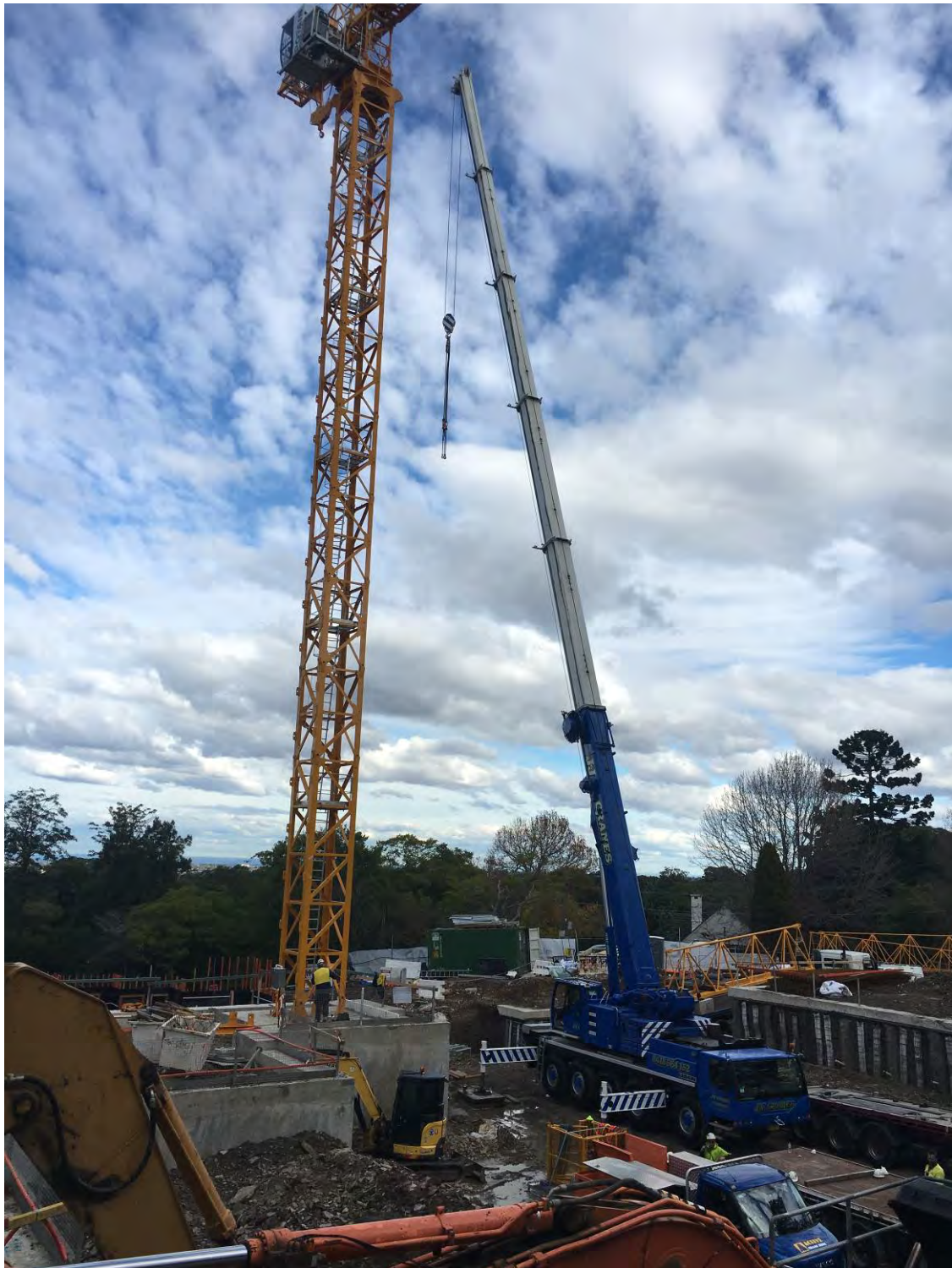
Photo 1 – The photo below from the 7 th of June, shows installation of the tower crane in the middle of the site.