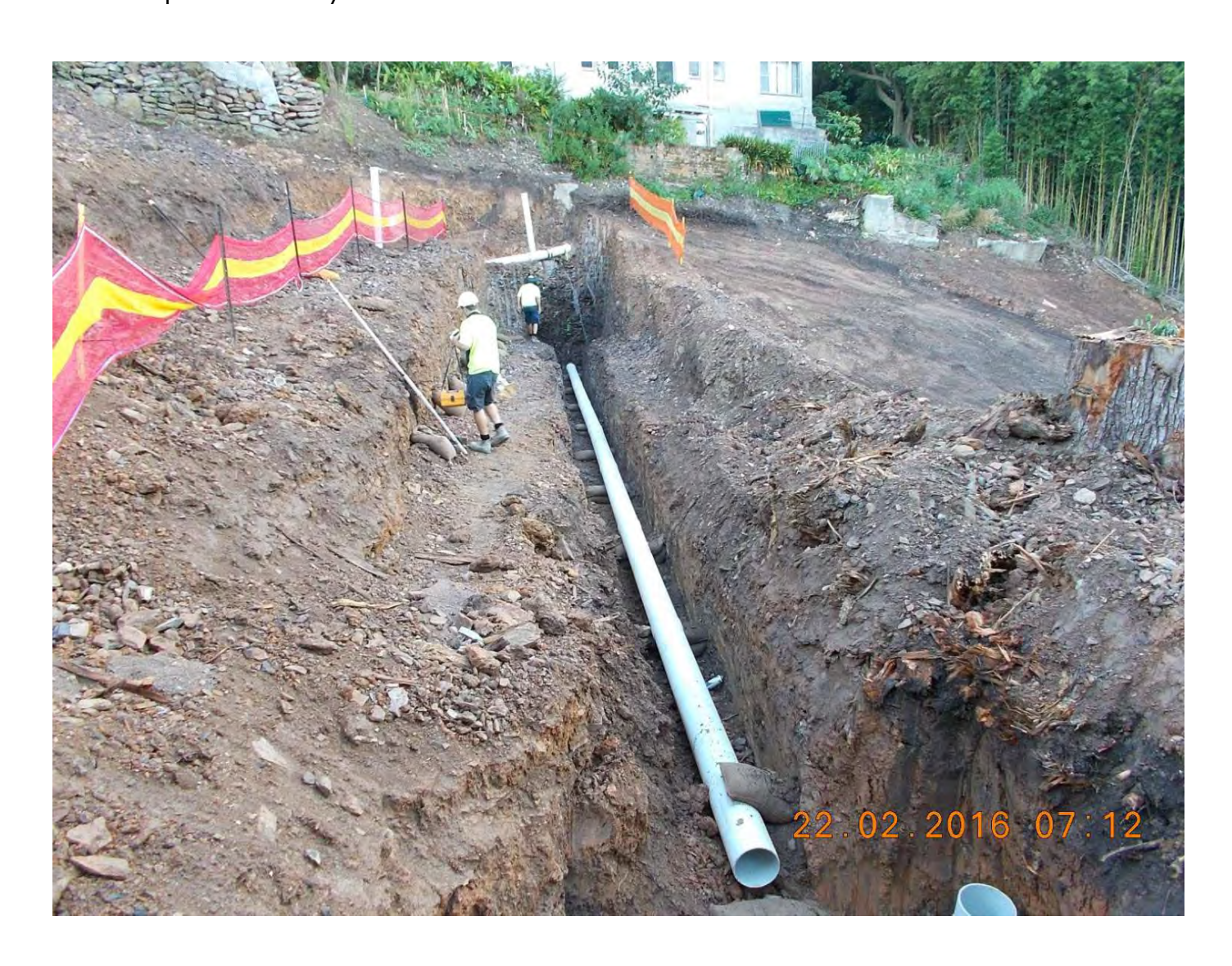
Photo 1 – The photo below from the 22^{nd} of February, shows the sewer diversion in place and ready for concrete encasement.