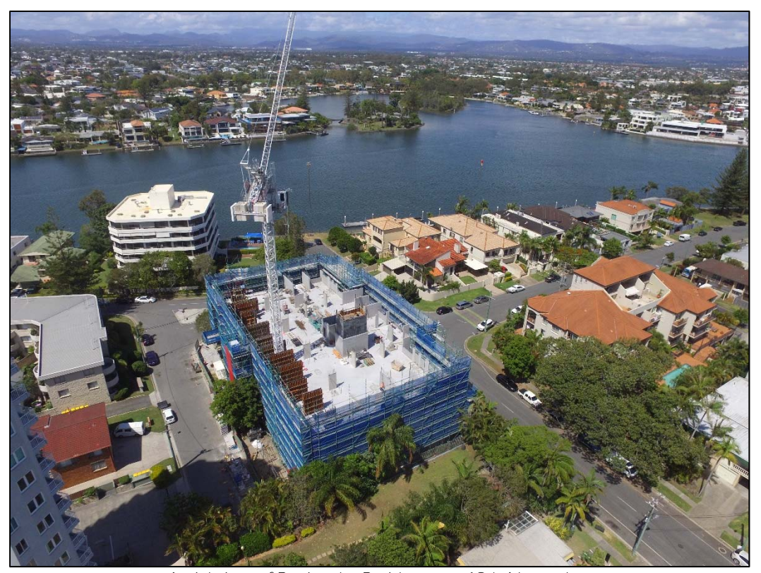
Aerial view of Peninsular Residences – 13th November