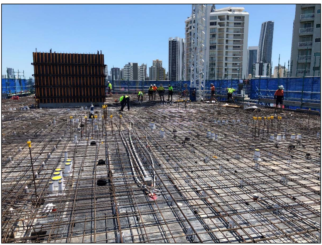
Level 4 Slab Reinforcing fixed to deck