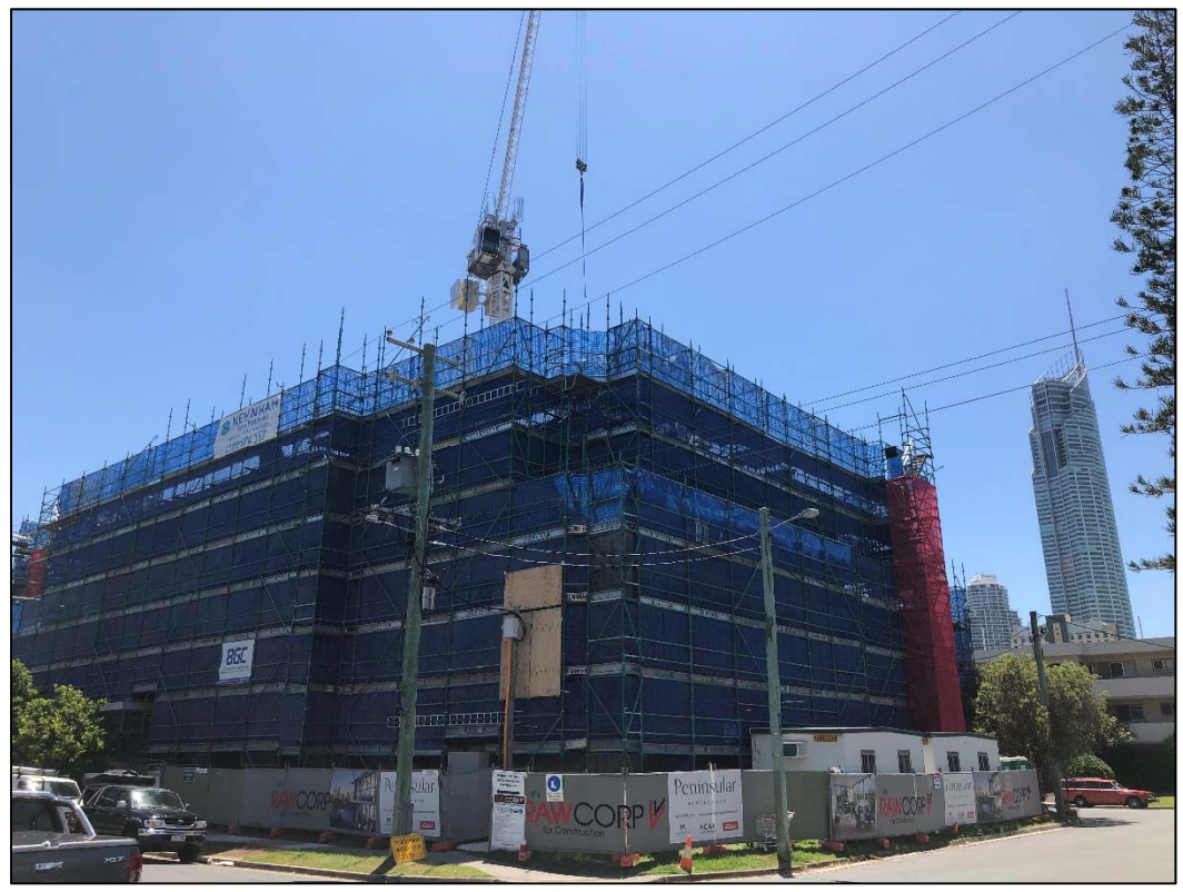
North East view of site.