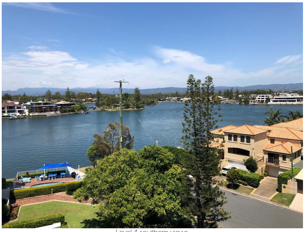
Level 4 southern views